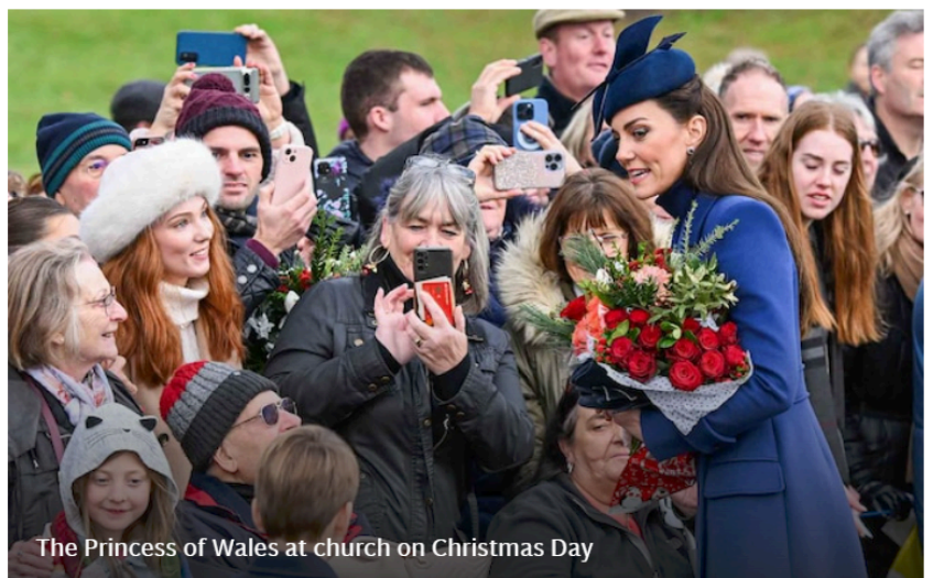
Picture 1. The main page of The Telegraph, March 24, 2024 issue

Social media conspiracy theorists are doubling down by saying diagnosis should have been revealed earlier