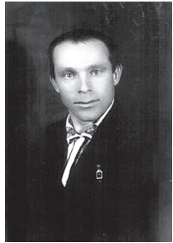
Fig. 6. Volodymyr Hrinchenko 2 × 2 km was

the highest part of Voznesenska Girka was to be leveled. At that time, excavation work was carried out manually without the use of mechanical means. Thus, the mentioned area of