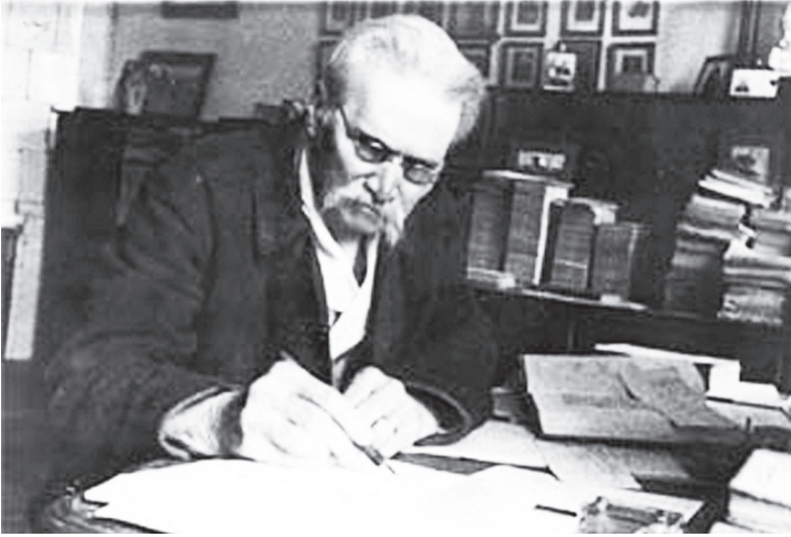
Fig. 1. Dmytro Ivanovych Yavornytskyi