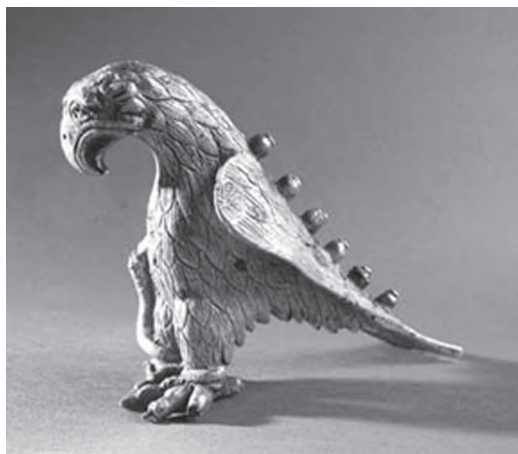
Fig. 10. Silver top of the Byzantine military standard in the form of an eagle. An artifact from the Voznesensky "treasure", Zaporizhzhia Museum of Local Lore

hopeless situation, and the surviving soldiers had to burn their military insignia (eagle and lion) along with their dead commanders and comrades so that they would not be taken by the enemy" [9, c. 61]. Among the finds were the figurines of an eagle and a lion, which V. A. Hrinchenko defined as signums — signs, emblems that the cohorts, maniples, and centuries of the Ancient Roman army had [9, c. 48]. One of the highlights of the Zaporizhzhia Regional Museum of Local