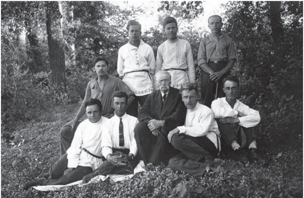
Fig. 2. Members of the DniproHES expedition, 1929 (after Попандоупо 2012, с. 266).

say that the 40,000 exhibits found by the expedition change the primitive history of mankind in South-Eastern Europe, so the entire scientific world is following the work of the expedition" [42].