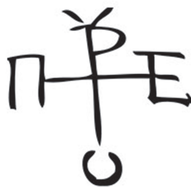
Fig. 12. The stamp on the chest of a silver eagle figurine and its drawing