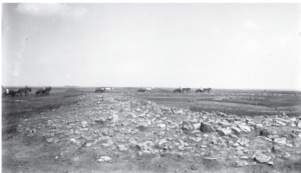
Fig. 7. Exploration of the stone rampart, 1930

squares [27, c. 9]. All 1195 squares were studied by him sequentially.