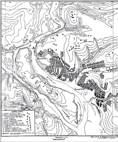
Fig. 5. Map of the location of Voznesenska Girka in Zaporizhzhia (after Komap 2002, c. 239).

Summary of the main material. In 1930, the DniroHES expedition carried out work near the Voznesenka village (now part of the city of Zaporizhzhia (fig. 5) at industrial site A, the site of the future metallurgical complex. 1 According to the construction plan,